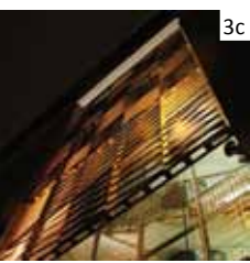
3c