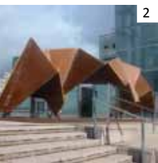
2 photo Rut Bryk