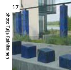
17

taik.aalto.fi/en/services/arabianranta More information on the works of art www.arabia.fi More information on the designers www.iittala.fi More information on the designers