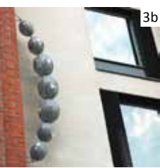
3b