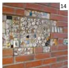
14

The academician Tapio Wirkkala (1915-1985) is known as a multi-talent and a brilliant designer. He has been dubbed the "poet of wood and glass". Wirkkala also worked as the head of what is currently the Aalto University School of Art and Design and won many awards at the Milan Triennial.