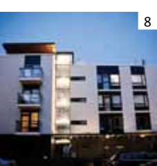
8