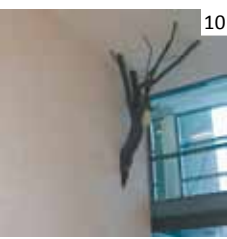
10