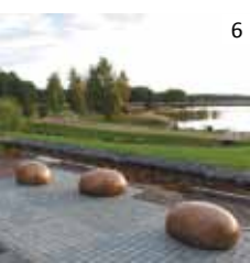
6

The bronze elements that are found on the ground lead to the pergola arbour which is situated on the water front of the Porcelain Garden. This is a scenic and relaxing location close to the sea where the elements can be seen to their full function as they serve as "spinning" stones for the wanderer to sit on.