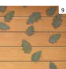
9