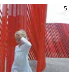
5